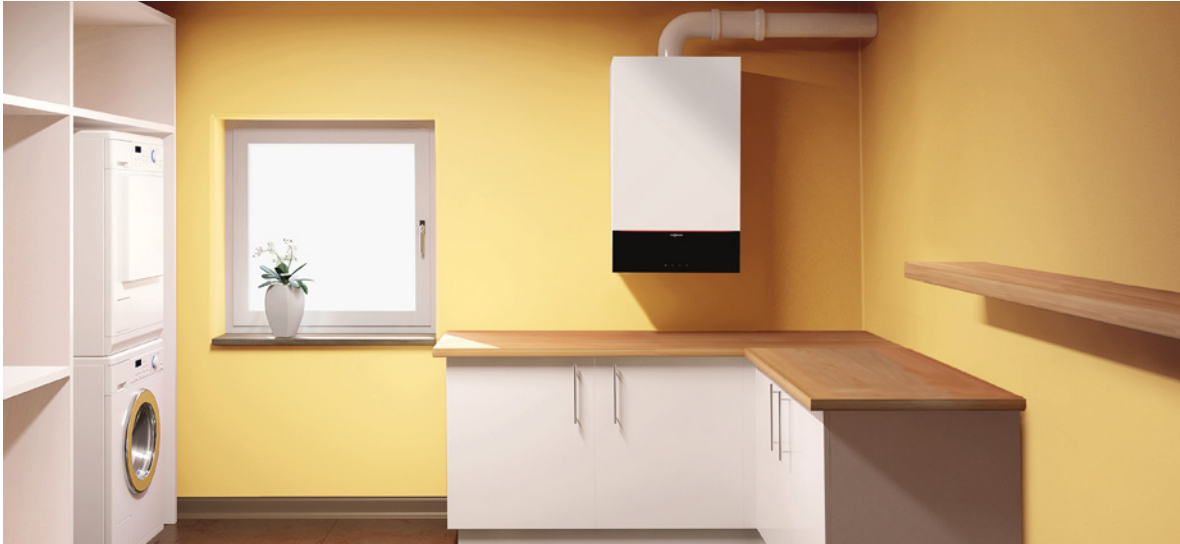
The Vitodens 100-W offers a reliable, compact solution for heating and on-demand domestic hot water (B1KE)

Equipped with a Viessmann stainless steel heat exchanger for lasting performance and reliability, plus a fully modulating Matrix Plus cylinder gas burner, the Vitodens 100-W wall-mounted gas condensing boiler is the perfect combination of value, quality and Viessmann technology.